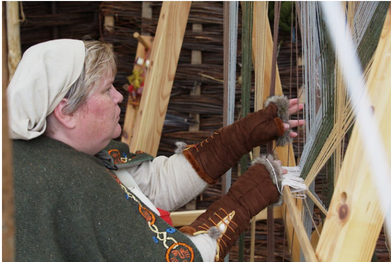
Life in a Viking village

Largs' Viking heritage is celebrated every year at the Largs Viking Festival. At the festival, visitors can go back in time and experience life in a Viking village. They can also watch a re-enactment of the Battle of Largs and the burning of a Viking longship.