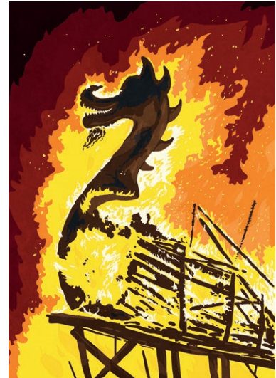
Burning of a Viking longship