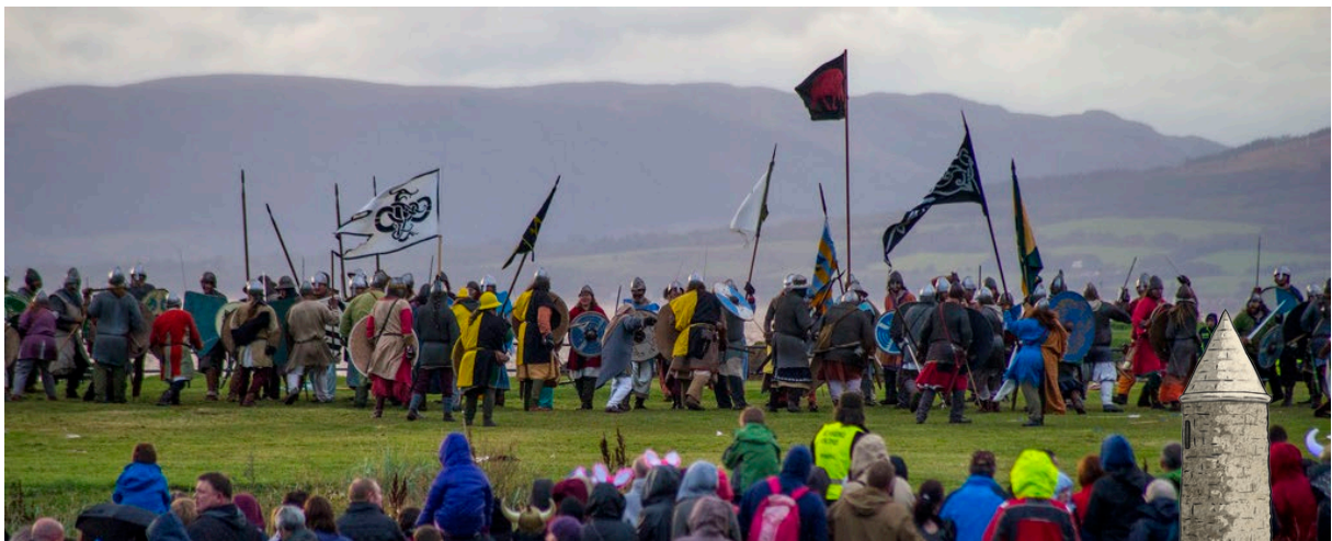
Battle of Largs re-enactment

To mark the end of the festival, there is a fireworks display at the Pencil Monument. The monument was built in 1912 to commemorate the battle.