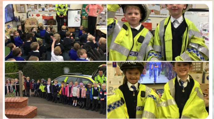
Visit from the Police