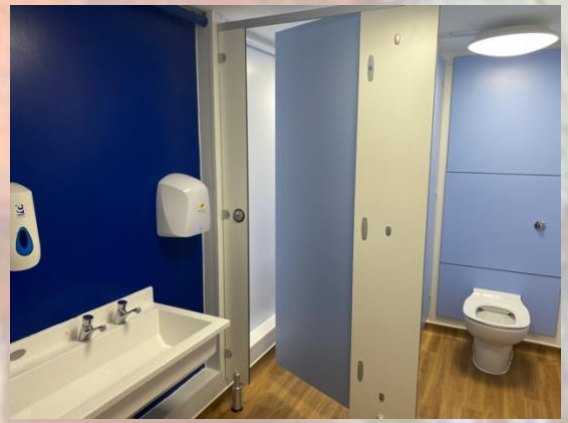
Our new KS2 toilet facilities

Our Key Stage Two toilet facilities have been refurbished over the summer holiday and are looking amazing! The replacement of the pitched roof is ongoing and is expected to be completed in the next few weeks.